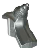
G/3/R 44 (option)