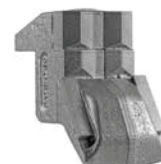
STC/3/FP (side scraper)